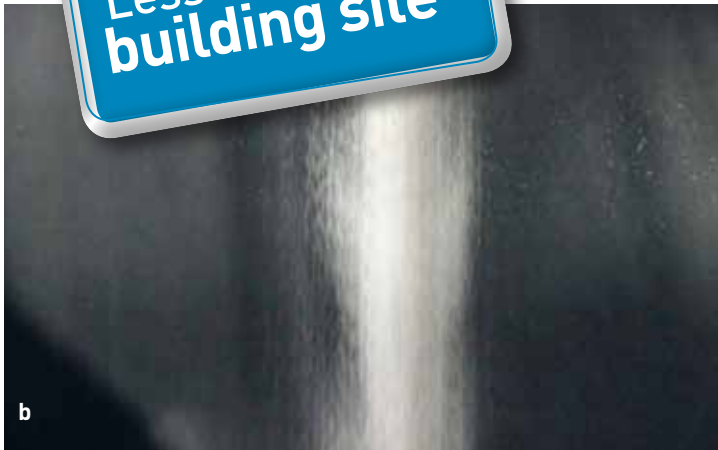
Comparison of dust emission from (a) standard quartz sand – heavy dust formation (b) DORSICOAT® PQK 8 – extremely low dust generation